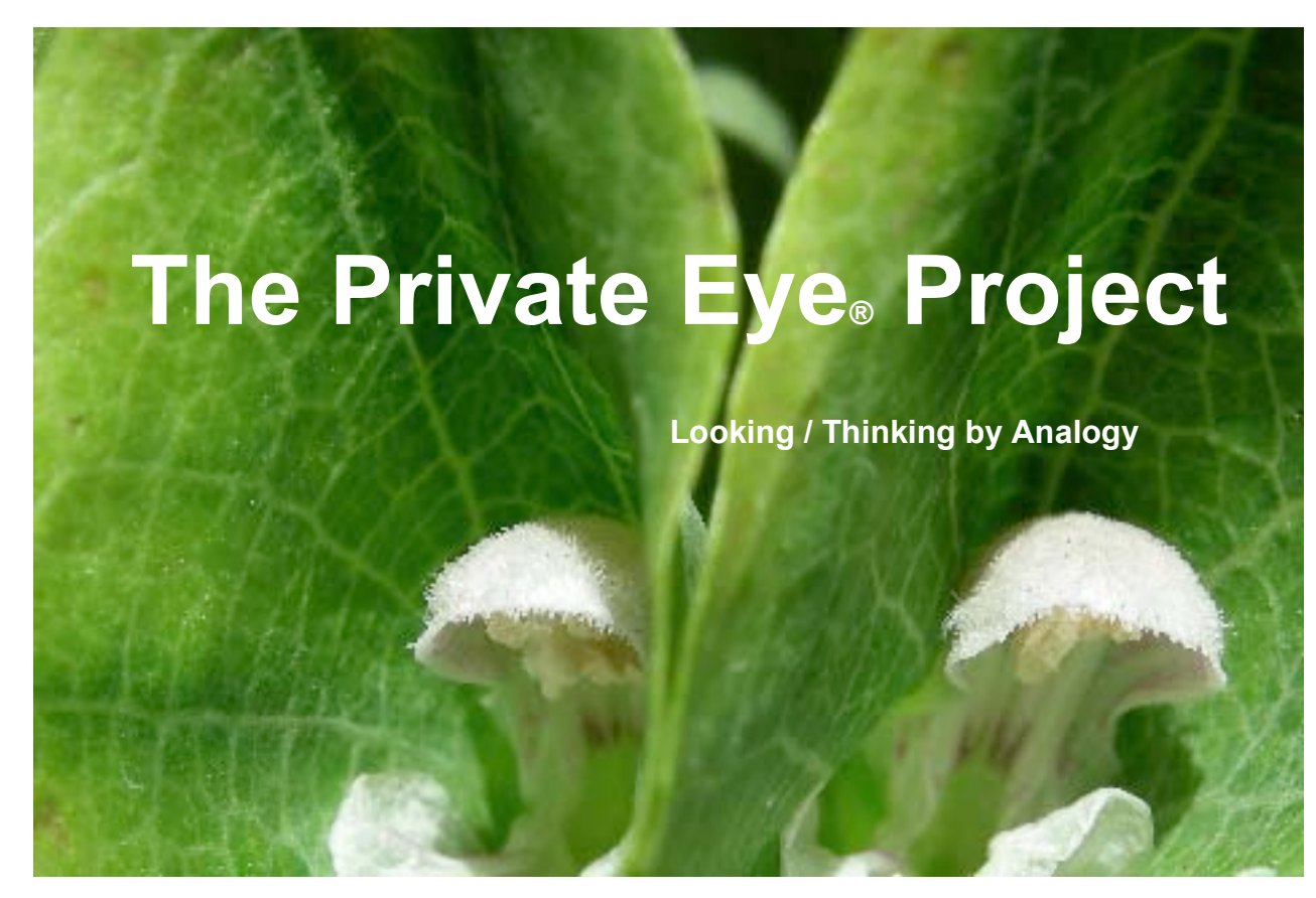
Grade 5 The Private Eye® aligned with Common Core State Standards