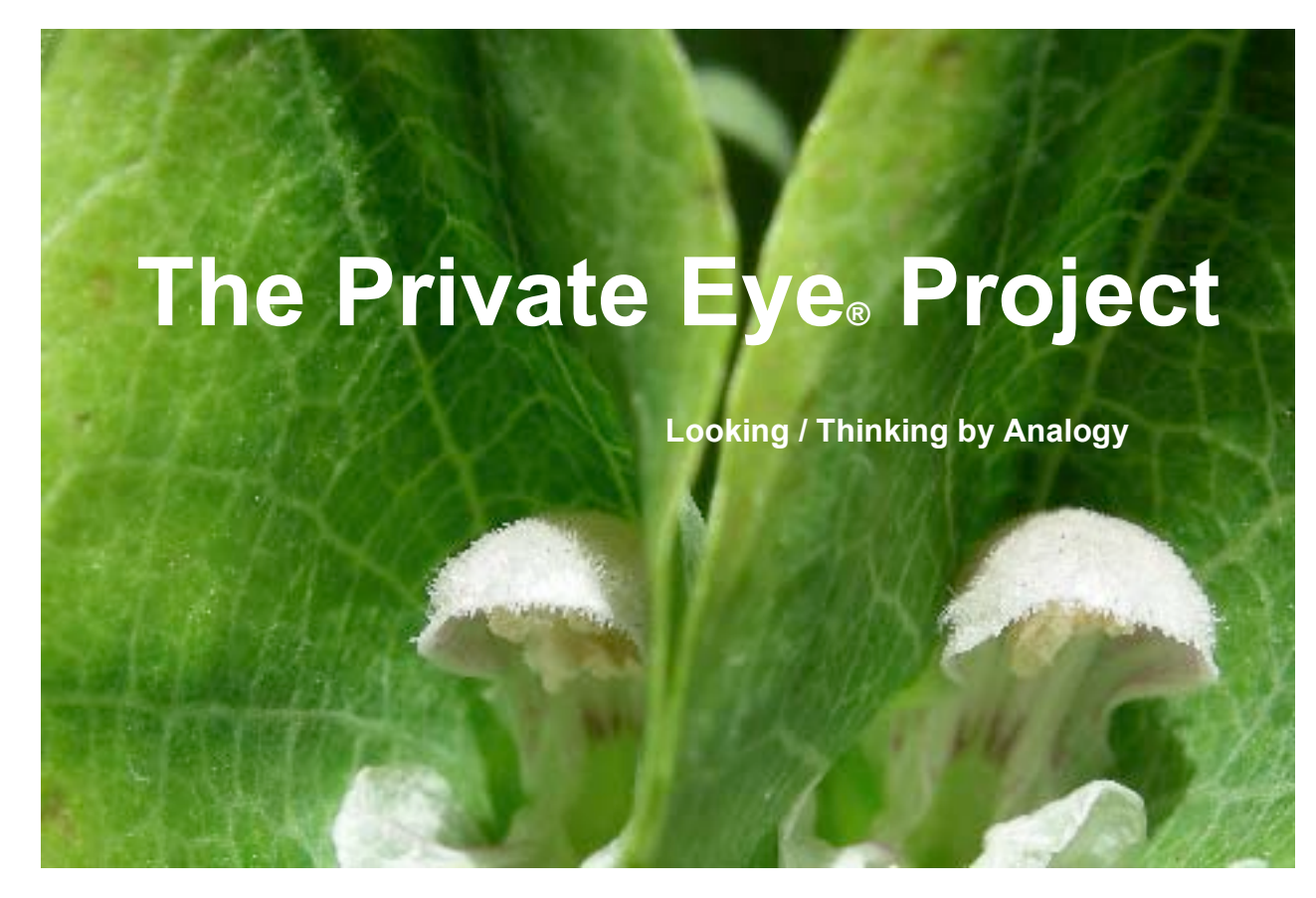
Grade 4 The Private Eye® aligned with Common Core State Standards